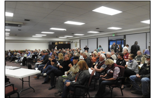
Members and guest enjoying program.