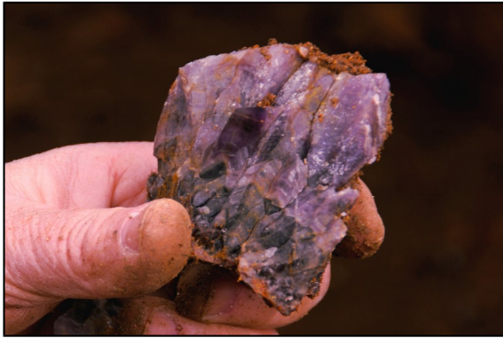
Amethyst from the New Hope claim

Show and Tell events at meetings, allow members to display what they've found on field trips. It's a great educational time where members get to share their experience with others.