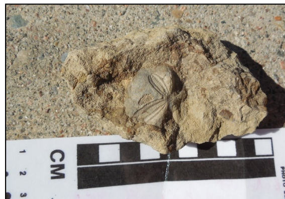
Sea Urchin found on a field trip by a member at TeePee Buttes