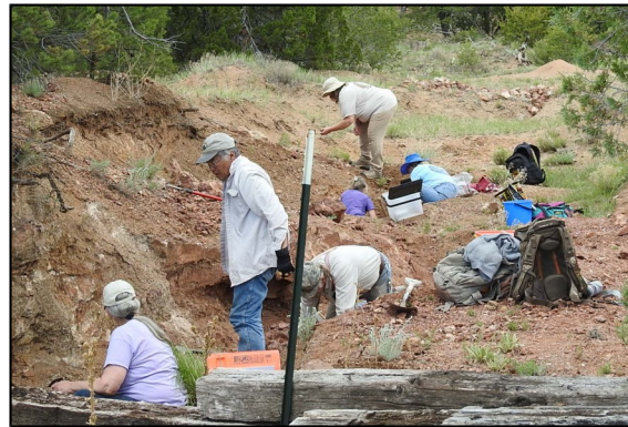
New Hope Amethyst Claim field trip for members